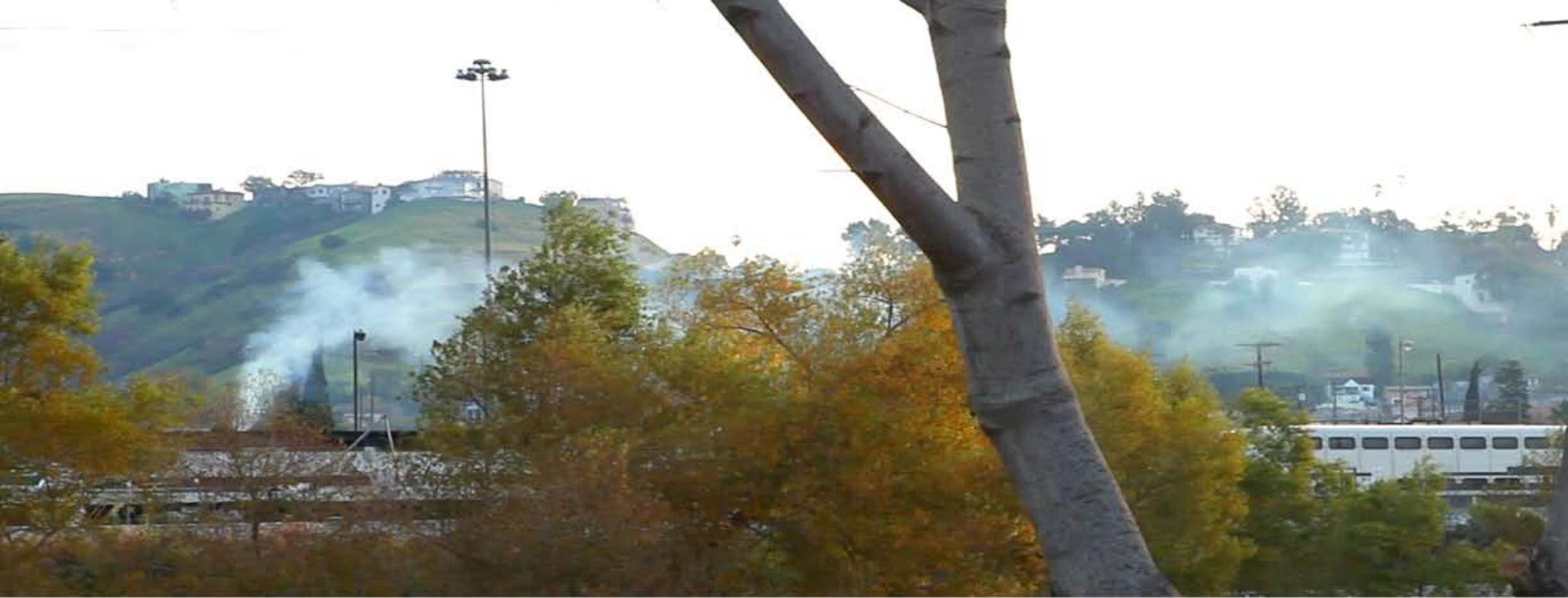
View from Elysian Valley